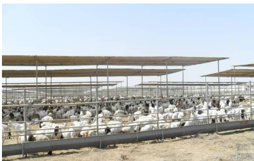
Sheep and goats for export at a quarantine station in Berbera

The University of Nairobi signed a consultancy agreement with FAO to undertake a livestock and meat value chain analysis on live animals, meat and livestock products in Somaliland in March/April 2011. The analysis aimed to understand factors that affect the development of a competitive Somaliland livestock and meat industry as well as identify areas of intervention to foster its development. The project was undertaken by staff from the Faculty of Veterinary Medicine. Data was collected from primary sources through focus group discussions using key informants, stakeholder workshops, observations of livestock marketing infrastructure and activities, slaughter and meat marketing activities, as well as trade in hides and skins. Secondary data was collected through literature search and available reports on various livestock issues. The study found out that Somaliland has organized livestock marketing and trading activities facilitated by organized livestock markets and elaborate quarantine stations that are based at the port of Berbera. However, livestock slaughter and marketing of meat faced a number of challenges that included inadequate infrastructure (Slaughterhouse and associated facilities and equipment), poor hygiene and lack of meat inspectors to carry out quality assurance of meat.