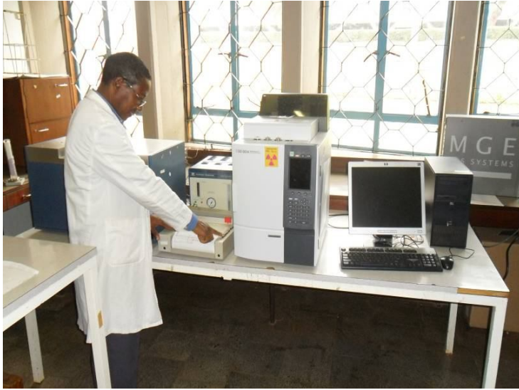
Technologist in the GC room where pesticide residue analysis takes place.