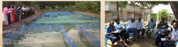
Team engaging fish farmers