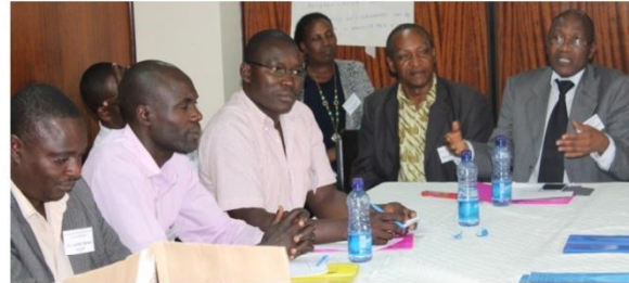
Doing research differently