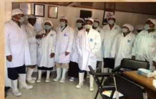
Research Team at J-Processing factory